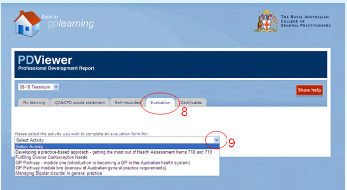
An example of an activity evaluation form